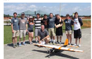
Ohio Northern University “Bad News Bears”