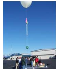
Wright State University