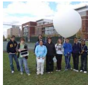
The University of Akron