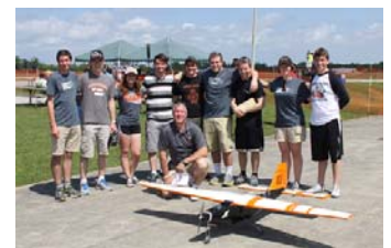
Ohio Northern University "Bad News Bears"