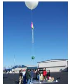
Wright State University