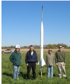
Lorain County CC