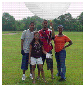
Central State University