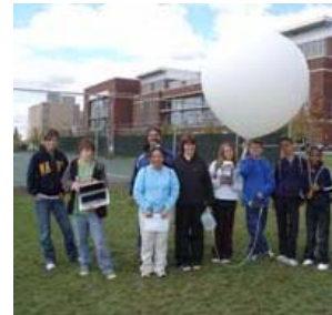
The University of Akron