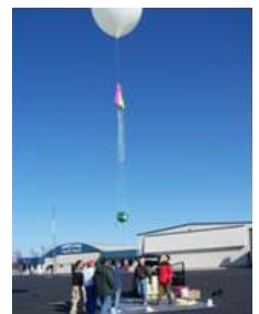
Wright State University