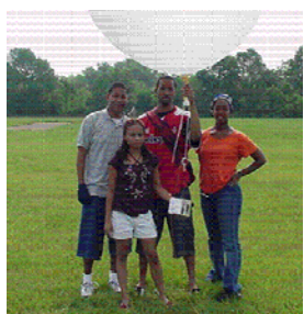
Central State University

prepare for the future STEM workforce. Funding is provided to student-led Balloon Satellite/Rocket/UAS/Design programs to member universities. To date, Central State University, Lorain County Community College, Miami University, Ohio Northern University, The University of Akron, University of Cincinnati, University of Dayton, The Ohio State University, The University of Toledo, and Wright State University all have active student-led teams.