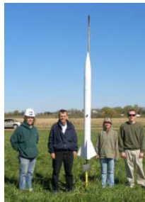
Lorain County CC