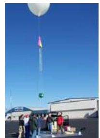
Wright State University