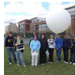
The University of Akron