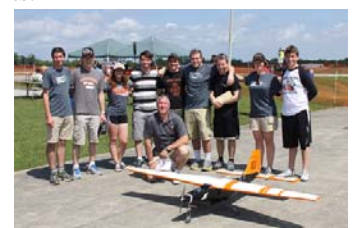
Ohio Northern University “Bad News Bears”