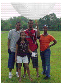
Central State University