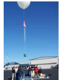
Wright State University