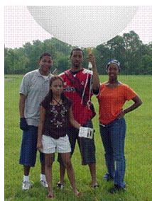
Central State University

Practical team-building skills are developed as students prepare for the future STEM workforce. Funding is provided to student-led Balloon Satellite/Rocket/UAS/Design programs to member universities. To date, Central State, Lorain County Community College, Miami University, Ohio Northern University, The University of Akron, University of Cincinnati, University of Dayton, The Ohio State University, The University of Toledo, and Wright State all have active student-led teams.