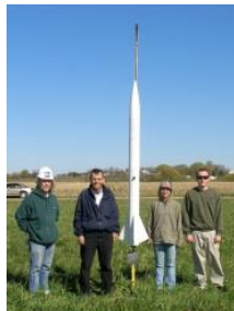
Lorain County CC