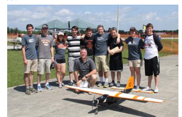
Ohio Northern University “Bad News Bears”